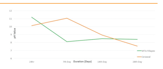
Figure 1. Plotlines representing the mean values of pH change over time for tested sealers

The mean values of pH of both tested materials at different immersion time period are described in following line chart (Figure 1). An ANOVA test revealed a statistically significant difference among the groups (P<0.05). Group 1 exhibited significantly higher alkalinity on first day. On 14^{th} and 28^{th} day no significant difference was found between thegroups. Following Table 1 shows mean value of pH changes.The bioceramic sealer exhibited high alkaline pH over a period of time with the maximum valueon the 7th day.